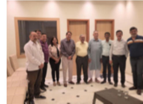
Snapshots from On-Ground Market Engagement

As representatives of Ward 64, we are committed to actively participate and spread awareness. We will also work towards adopting these best practices in our ward.”